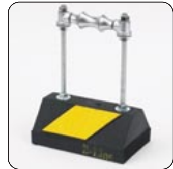
CR10-12 Base with ATR Riser & Pipe Roller Support - 12" High Supports up to 3 1 / 2 " pipe.