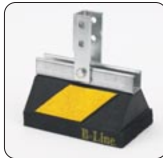
CS - Series Base with Channel & Adapter Leg