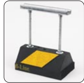
CE - Series Base with ATR Riser & B54 Channel Adjustable up to 16" high Allows support fittings to be attached to channel.