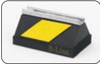
C - Series Base with B54 Channel 4 13 / 16 " High Allows support fittings to be attached to channel.