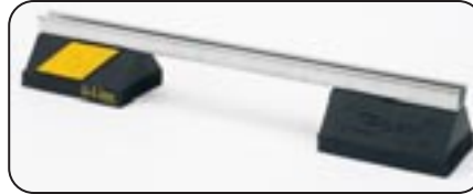
CB - Series Two (2) Bases Bridged with B22 Channel Allows support fittings to be attached to channel.